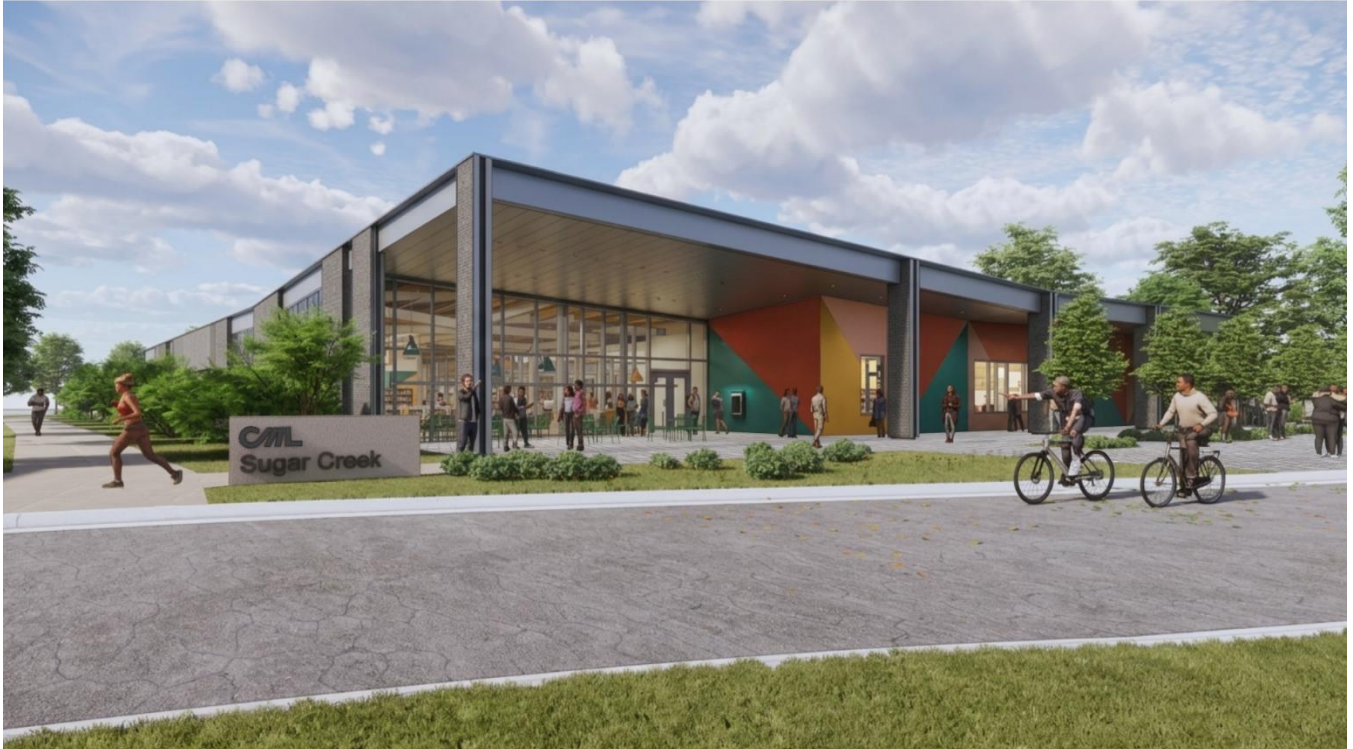
Sugar Creek Library rendering

Sugar Creek Library Stitt Rd Charlotte, NC 28213 An Arts & Science Council Project for Mecklenburg County