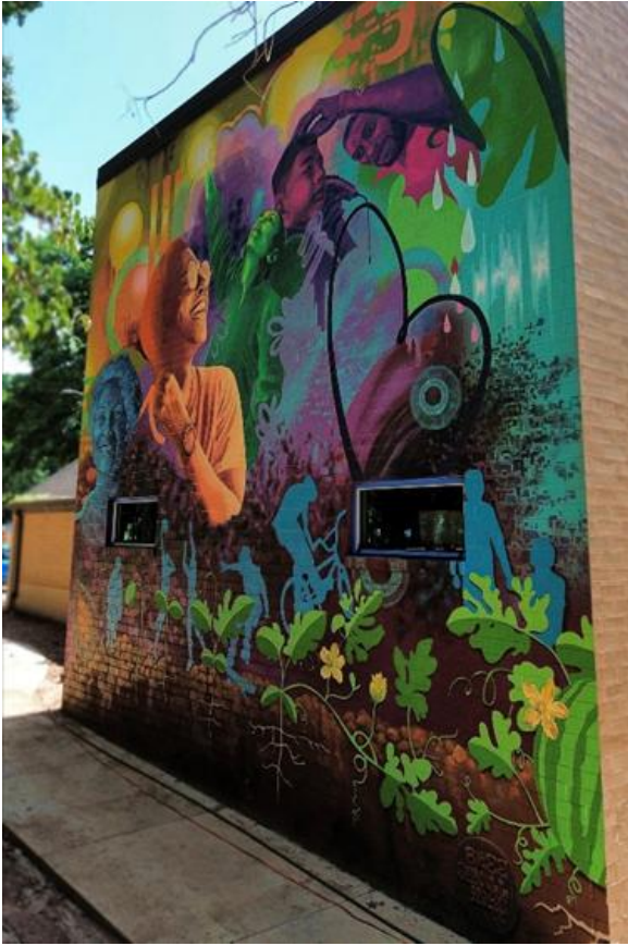
Bree Stallings. Generations of Growth . 2025. Naomi Drenan Recreation Center.

Medium: Latex Paint Budget: $63,750.00