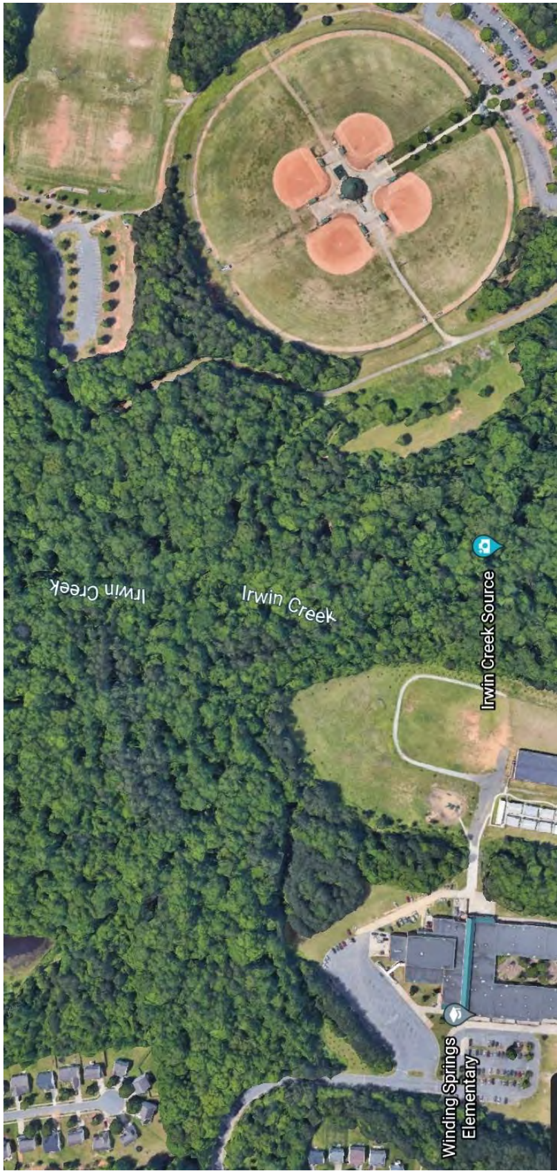
Irwin Creek Detail (Google Earth)