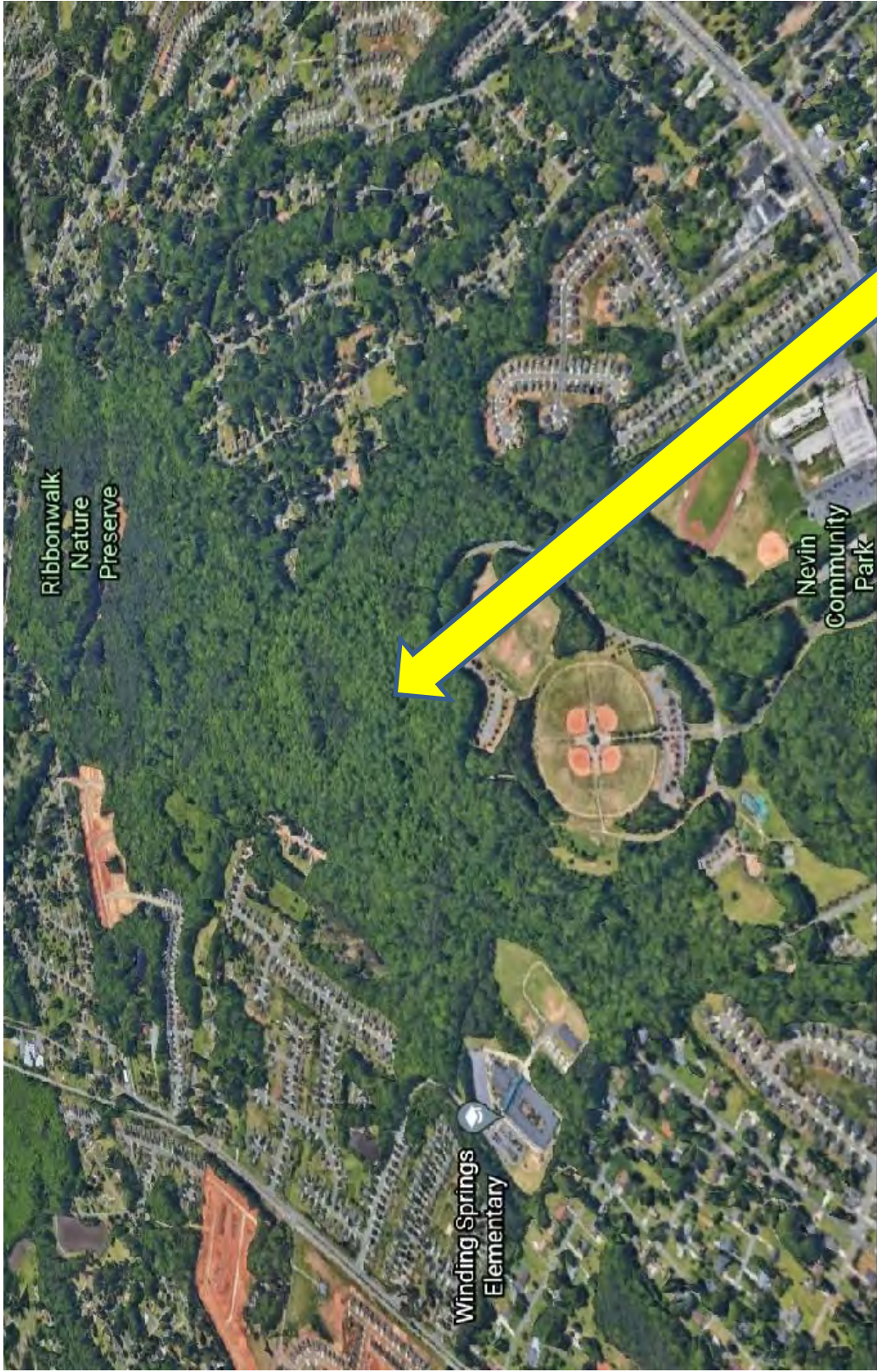
Irwin Creek Area

Irwin Creek Greenway, to be sited between Ribbon Walk Nature Preserve and Nevin Community Park